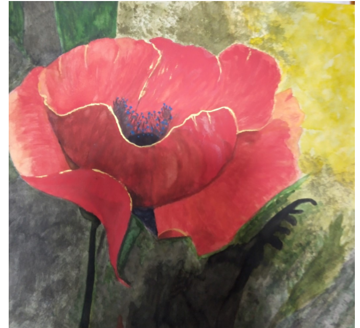
Poppy by Pauline Caulder