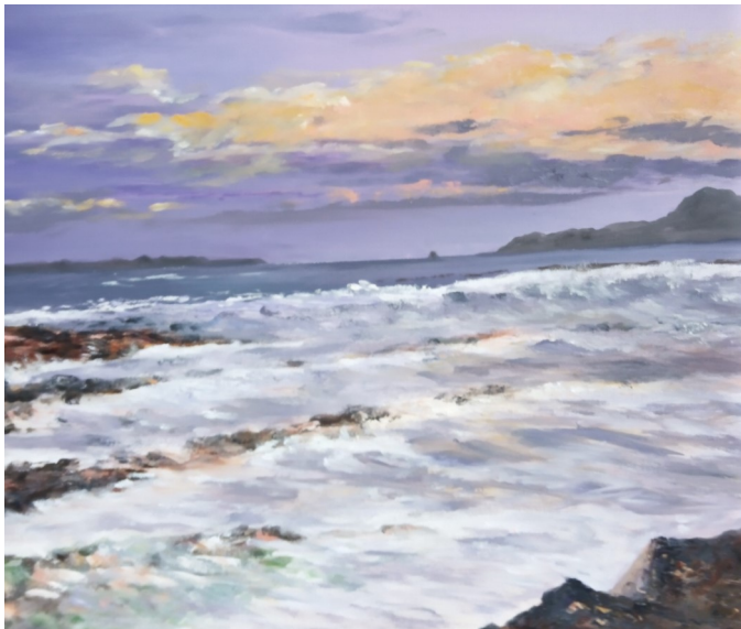
Seascape by Nola Dixon