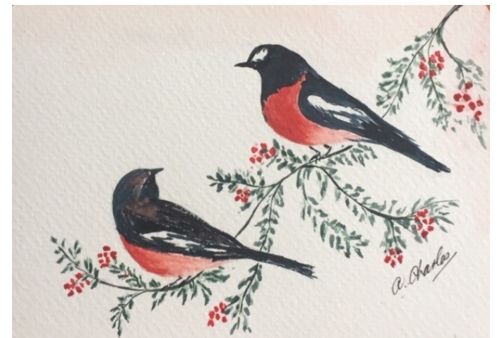
Scarlet Robins